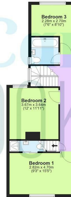
First Floor Approx. 50.9 sq. metres (548.1 sq. feet)